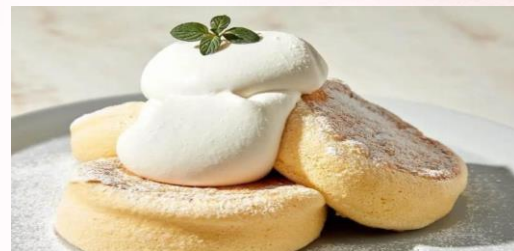
Flipper's Umeda EST