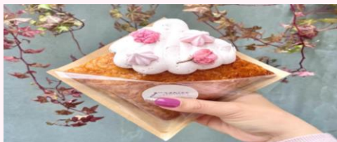
Grenier Umeda branch