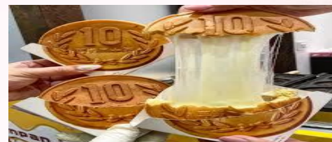
10 yen bread (cheese coin)