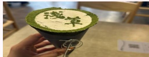
Asakusa Chaya Tabanenoshi