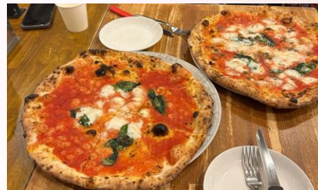
La Pizza Napoletana Regalo

Very popular for Pizza , chef makes and serves pizza himself