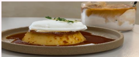
HICARU COFFEE ROASTER